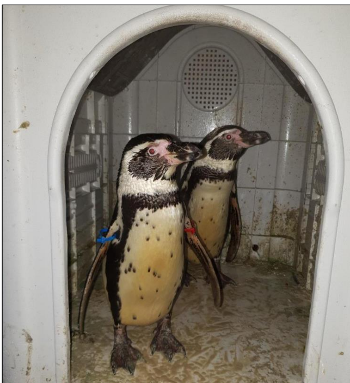
Pictured: Photo of the rescued Humboldt penguins taken from the Notts Police twitter page.

A pair of missing penguins, stolen from a zoo in November, have been rescued by police and quickly returned to the zoo they were taken from. Police found the two Humboldt penguins in a small village just outside Nottingham following a tip off.