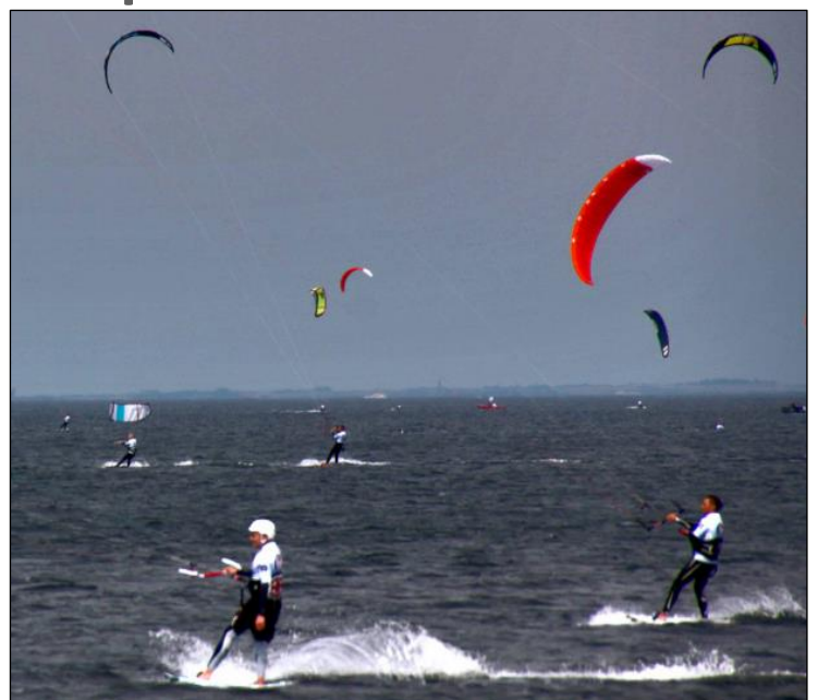
Pictured: Typical Kite surfers.