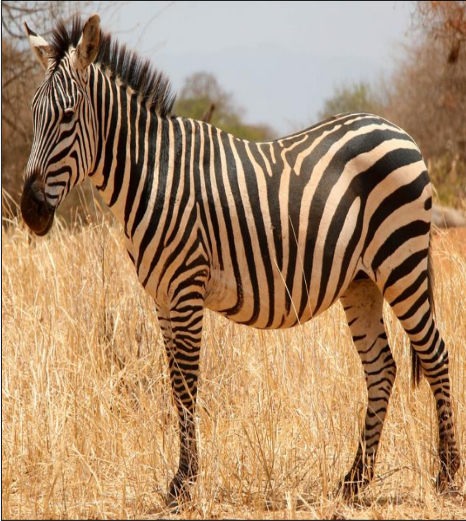
Pictured: A typical Zebra.

For years we have known that the black and white stripes on a zebra's body were a vital deterrent to horseflies. Scientists believe that the striped pattern reflects light making it harder for insects to see them!