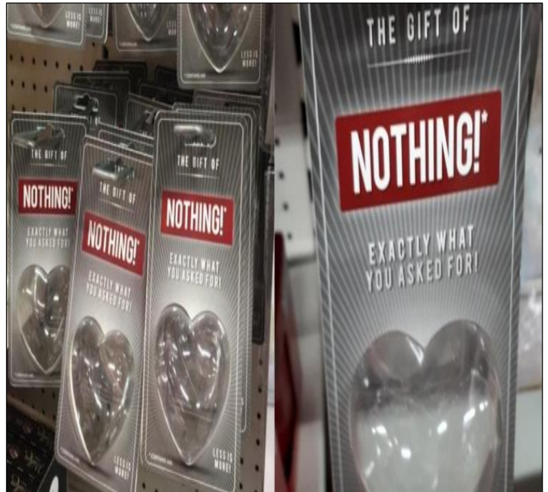
Pictured: The gift of nothing.