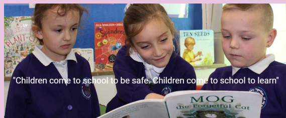
"Children come to school to be safe. Children come to school to learn"