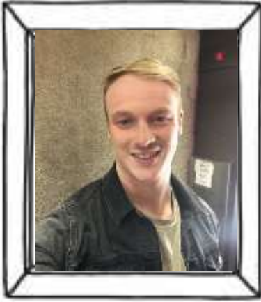
My teacher is called