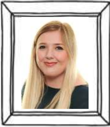
My teacher is called