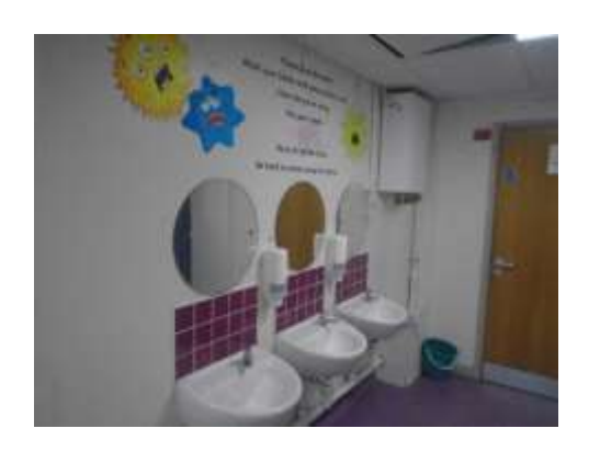
This is where you will go to the toilet and where you will wash your hands!